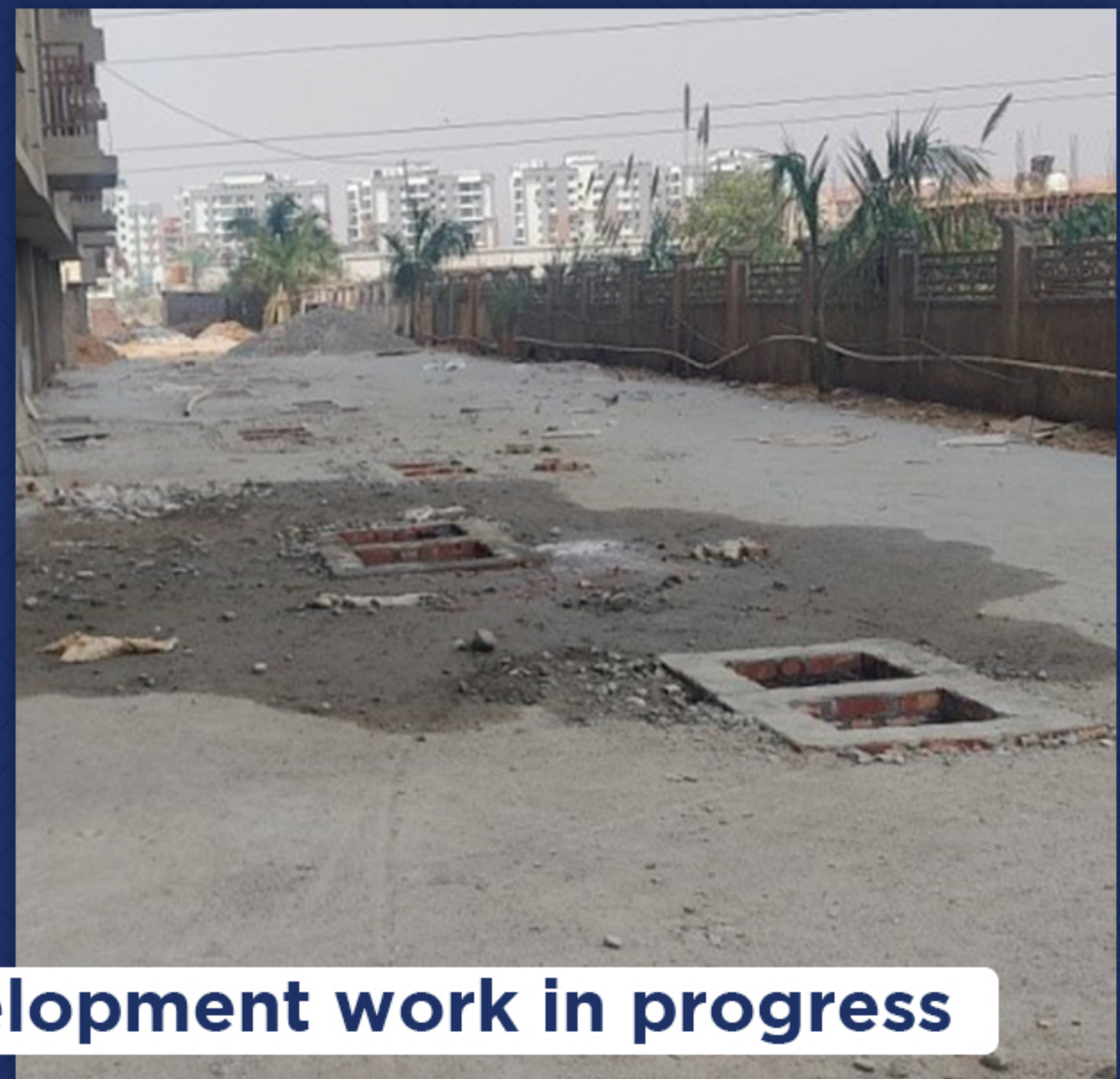
Sewage Line & Road Development work in progress