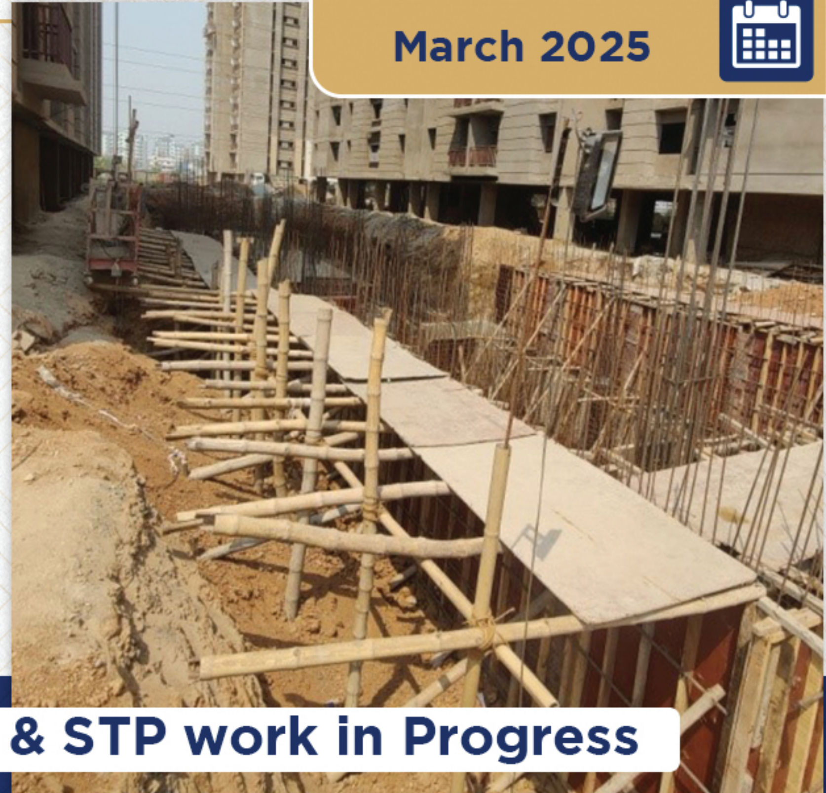
Club House Foundation & STP work in Progress